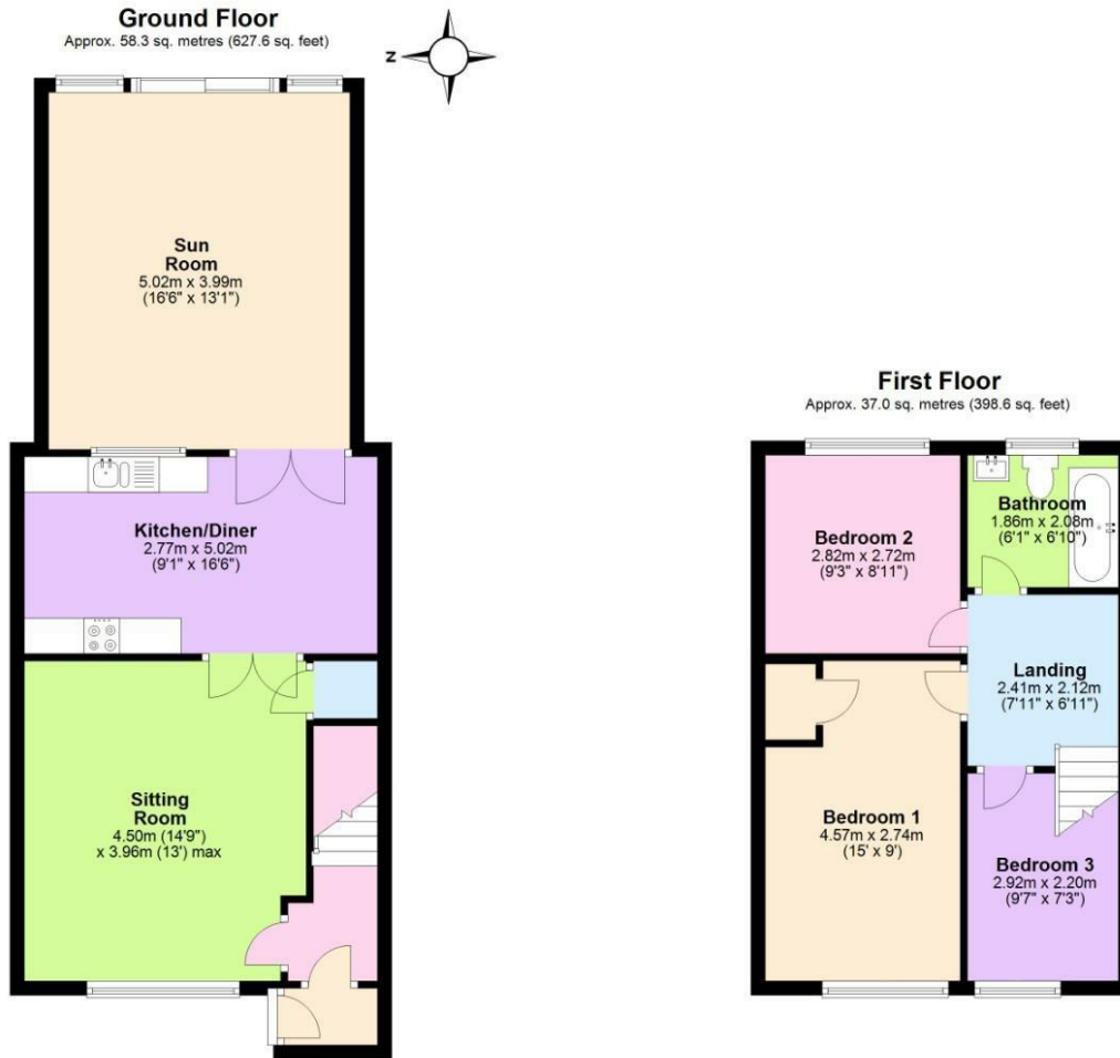
Total area: approx. 95.3 sq. metres (1026.2 sq. feet) 9 Cherry Tree Close, Bristol